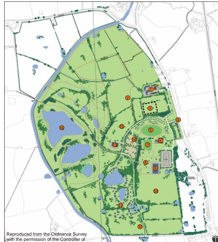
Reproduced from the Ordnance Survey with the permission of the Controller of